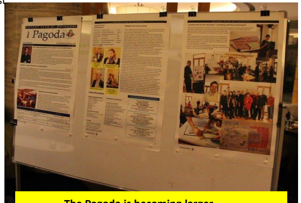
The Pagoda is becoming larger.....